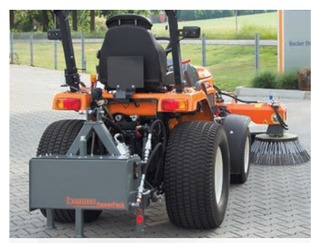
bema PowerPack - hydraulic power unit