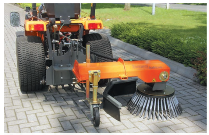
bema Groby light, rear mounted (three point linkage)