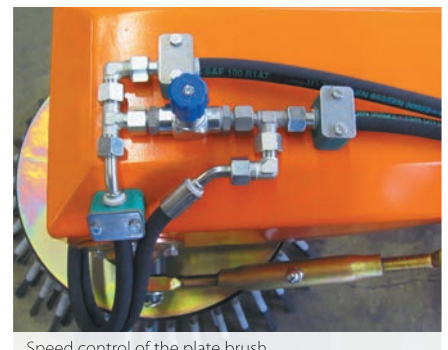
Speed control of the plate brush