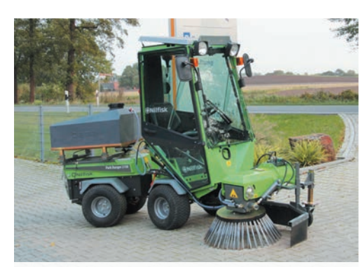
bema Groby light on a equipment carrier