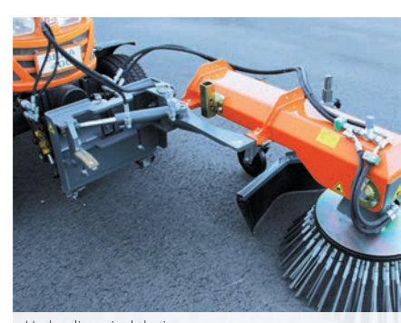
Hydraulic swivel device