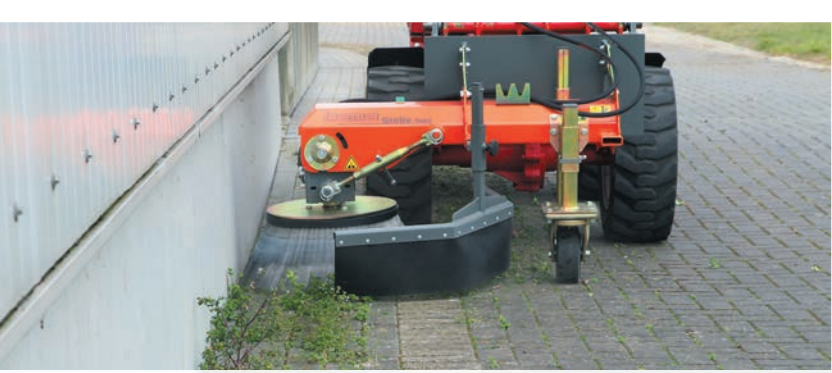
bema Groby light, support wheel Ø 200 x 80 mm (height adjustable)