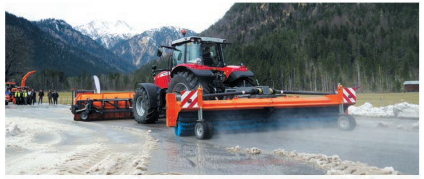
bema Jumbo Airport Turbo convinces with a 5200 working width

Mechanical drive via gearbox (at 5200 mm on both sides, low-maintenance), lighting system according to the road traffic regulations (StVZO), hydraulic swivel device incl. adjustable restrictor and protective cover.