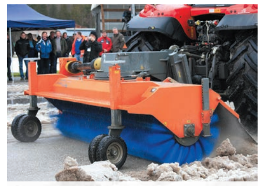
bema Jumbo Airport Turbo on tractor rear