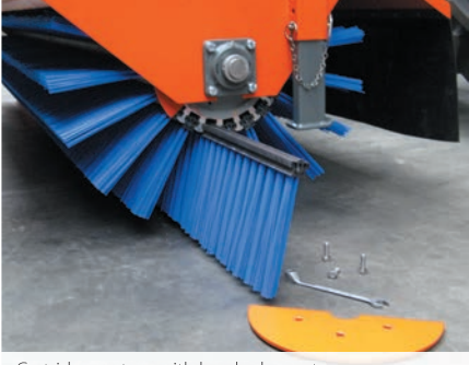
Cartridge system with brush elements