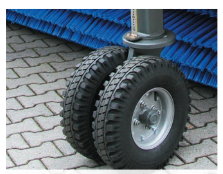
Sturdy twin wheels 5.00-8 with reinforced rims (5 mm)