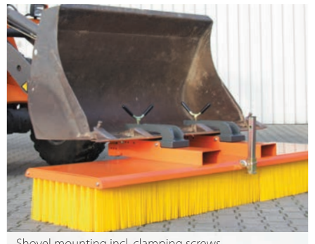
Shovel mounting incl. clamping screws