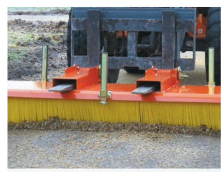
Pallet mounting with a tool-free locking