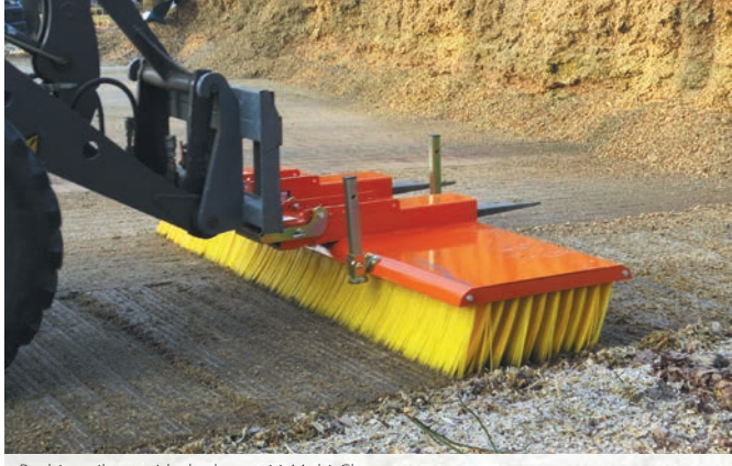
Pushing silage with the bema 11 Multi-Clean