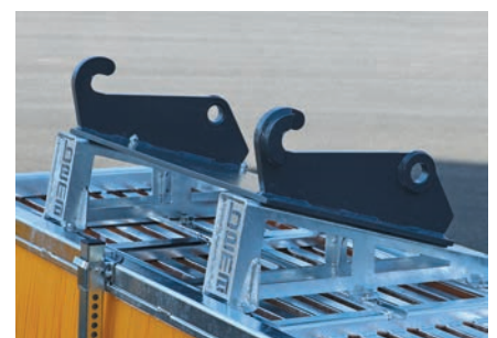
bema 11 MultiClean - quick change adaptor