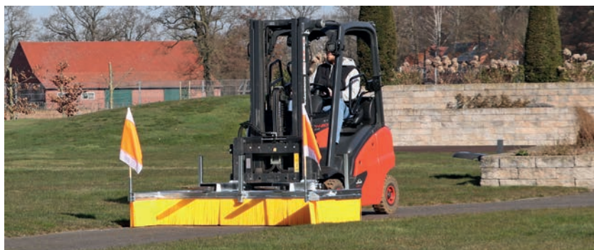
bema 11 MultiClean with side boom right and left (optional)

QuadLine® mounting console Quad, ATV, UTV