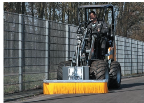
bema 6 MultiClean without side boom