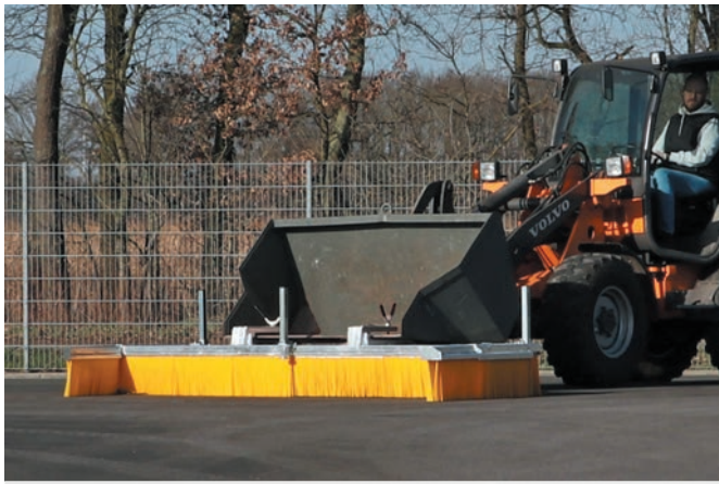
bema 11 MultiClean with shovel mounting incl. clamping screws