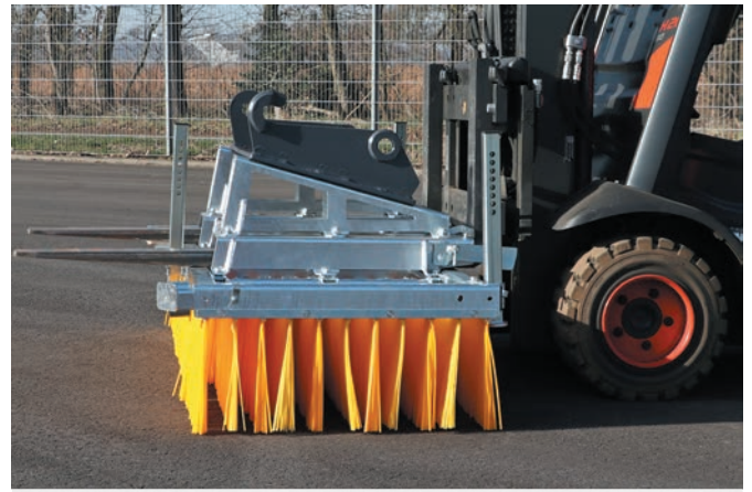
bema 11 MultiClean, modular combi attachment