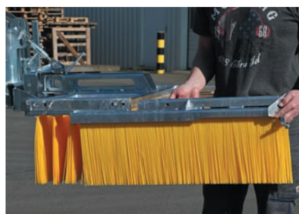
Optional side boom - pluggable