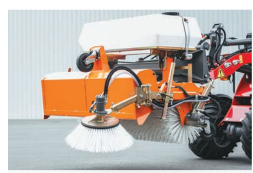
bema 20 Dual with full equipment, collection container in proven Dual system