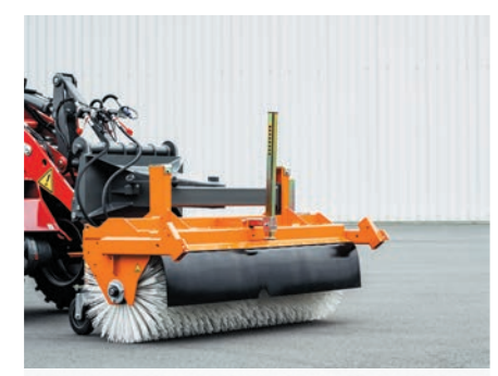
bema 20 without collection container (free sweeping)