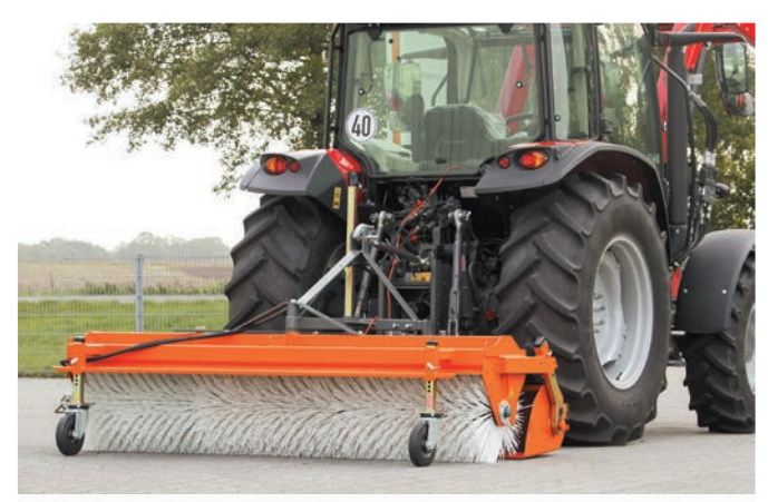
bema 20 mounted on tractor rear