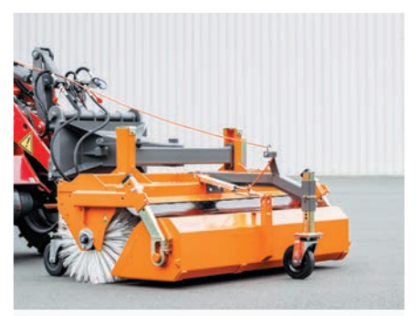
bema 20 (empyting via rope)