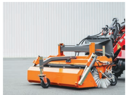
bema 20 (hydraulic emptying)